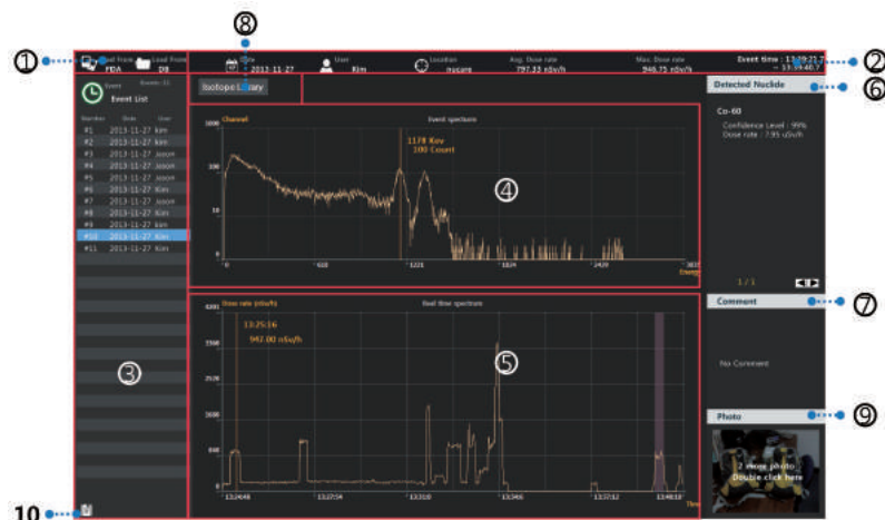
Command Center SW