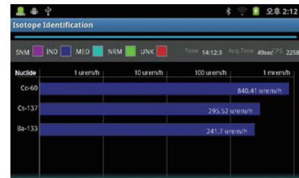
Radionuclide ID analysis